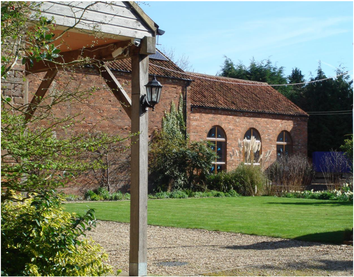
Renovated Victorian Barn – Glebe House

The rest of the yard, however, was demolished and planning permission granted in 1995 for two dwellings, one of which has been named Stack Yard House in recognition to the site's original use. This change marked the disappearance of the final visible link between farming and the village centre.