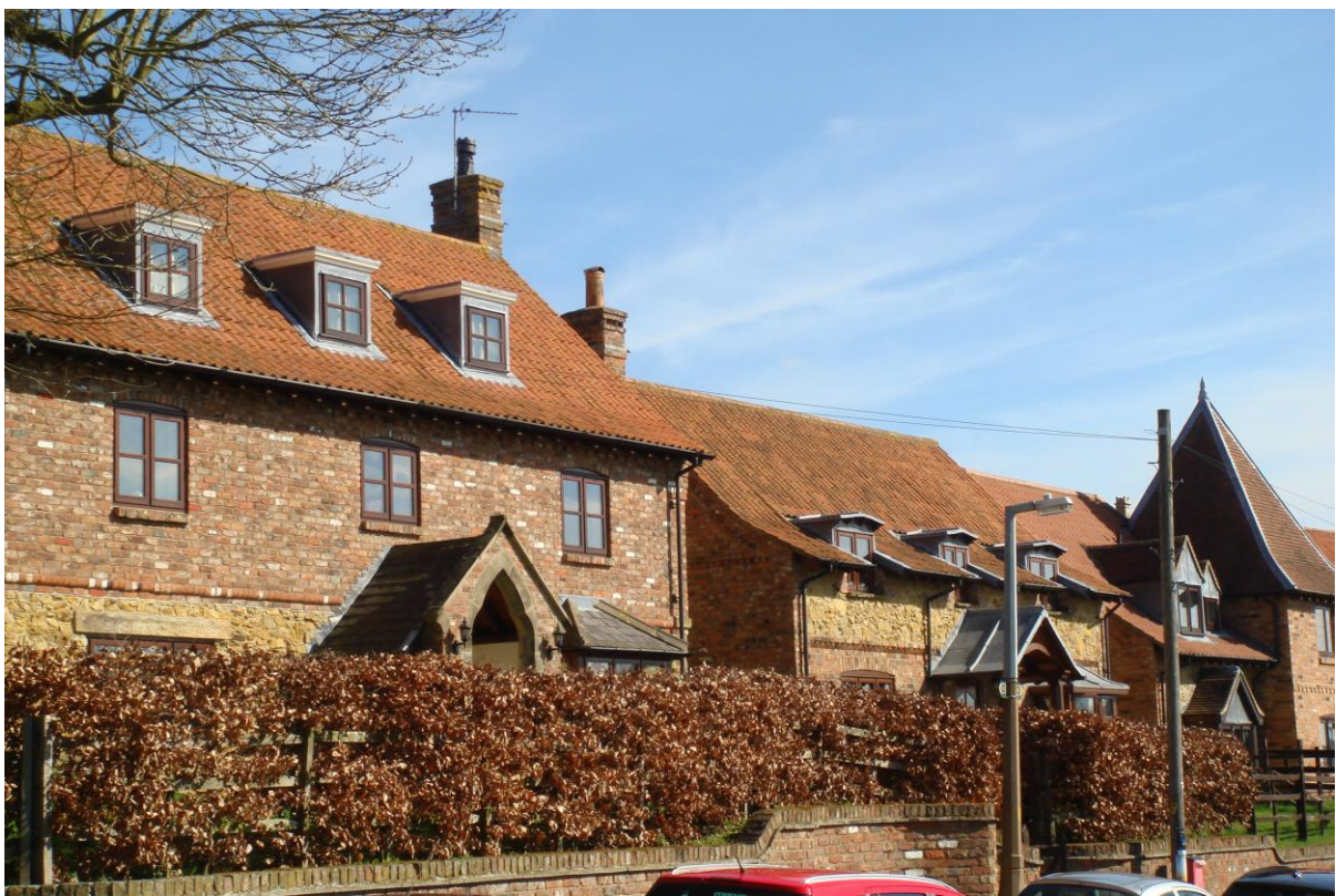
New housing built on the site of the old Wesleyan Chapel and in the old lime pits (behind)

Although planning permission was granted in the 1980s to Butterley Aggregates for houses to be built in the old chalk (lime) pit, there were long delays before there was any action and the Parish Council complained on several occasions to the company about the unkempt and dangerous state of the site. It was not until the late 1990s that all the quarry buildings and the old Wesleyan chapel were demolished and the 7 new houses were finally occupied in the new millennium. There is no doubt, however, that this development removed the most prominent eyesore in the village.