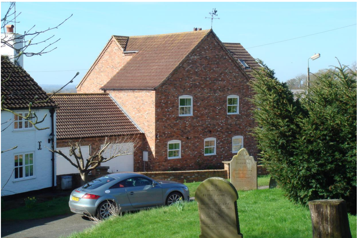
A completely rebuilt Manor Farm on old foundations