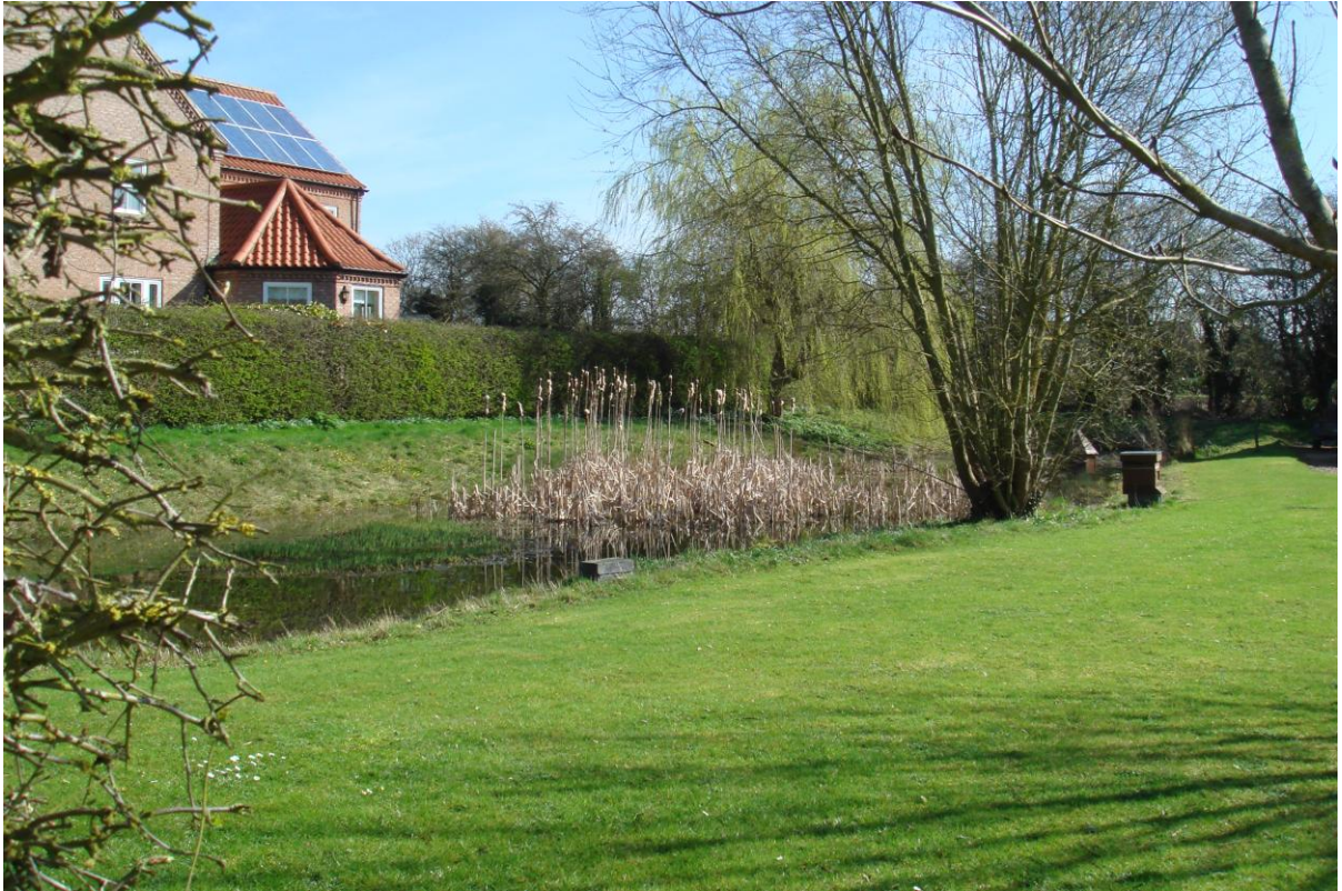
Dove-cote Pond, now part of a private garden in Wilmore Lane