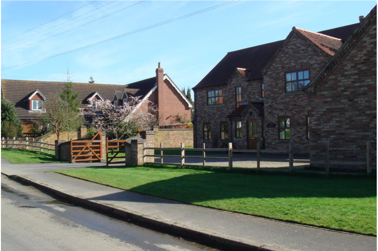
New housing in old Vicarage Farm stack yard