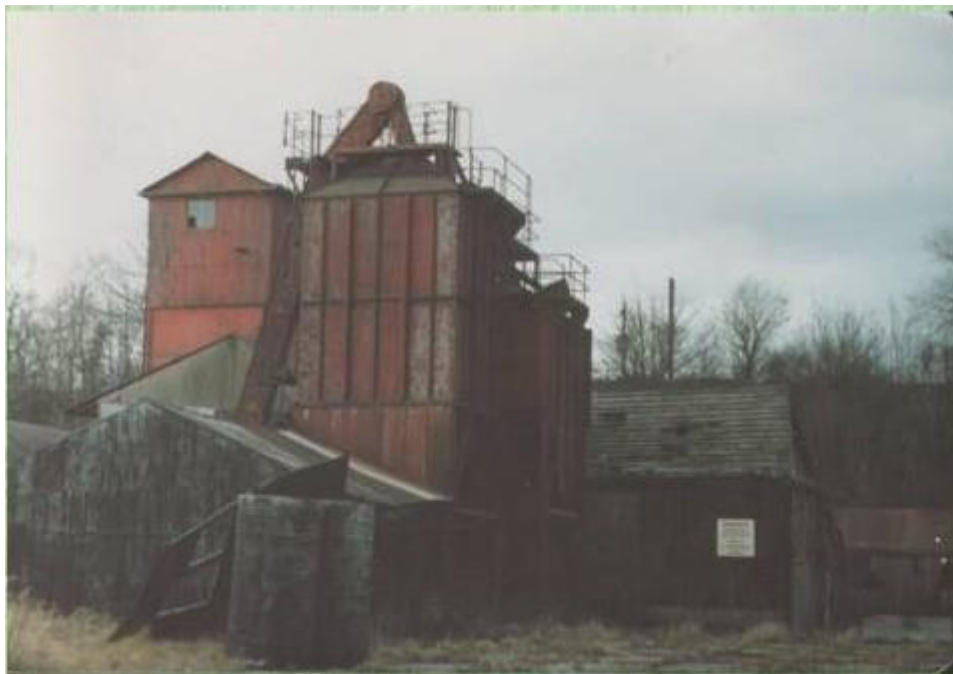
The disused crushing plant in the old Lime Works on Vicarage Lane opposite and slightly west of Reading Room Cottage (likely date 1970s)