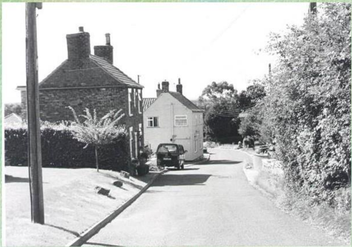
Photographs taken looking south from near top of Church Hill. The Blacksmith's cottage (centre left) remains but the two cottages below this have been demolished.