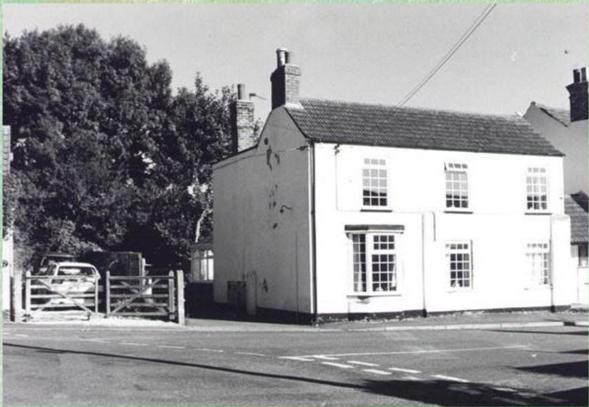
The shop is now a private house. The location is at the bottom of Front Street. The road bottom left, lower photograph, is the top of Bentley Lane.