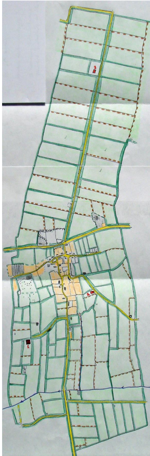
Grasby in C21 st (orange : newly built-up areas; green : hedgerows; brown dashes : grubbed-up hedges; red : 3 remaining farms in parish)