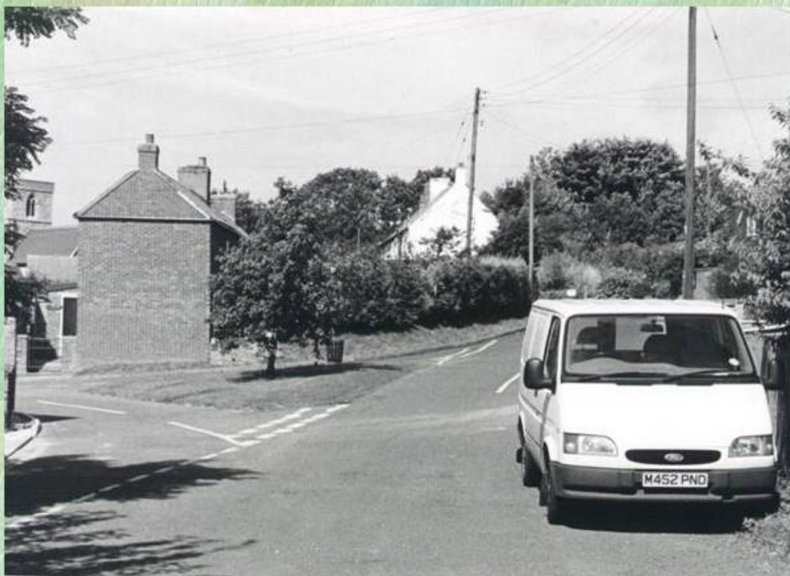
Possibly the Village Green – pictures taken at beginning of Clixby Lane looking west