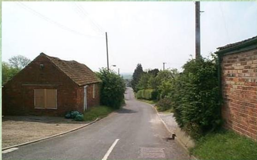
The workshop (centre left) has now been demolished. The view is south from part way down Front Street looking towards Canty Nook and Bentley Lane.