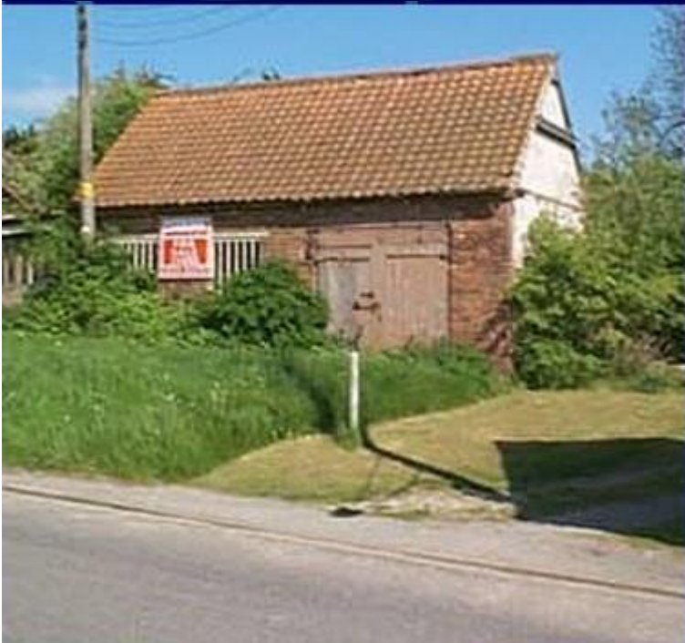
Wheelwright's workshop on east side of Front Street, now demolished.