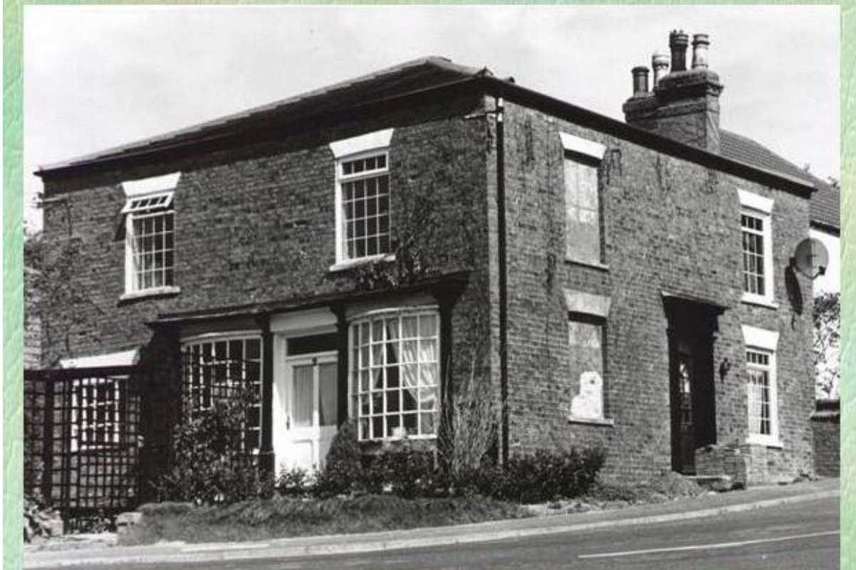
The Post Office is a Grade II listed building on the corner of Main Street and Vicarage Lane