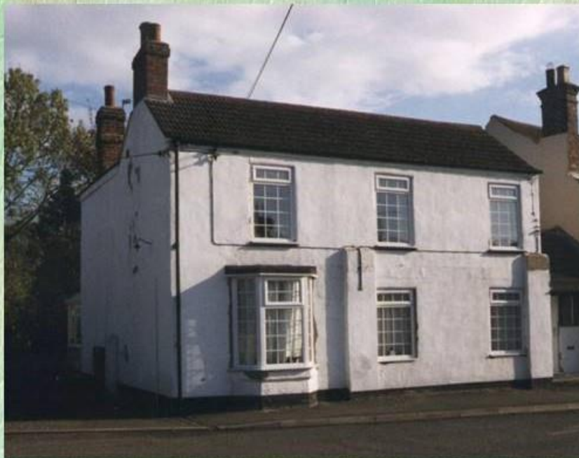
An earlier photograph of the shop – note the absence of petrol pumps.