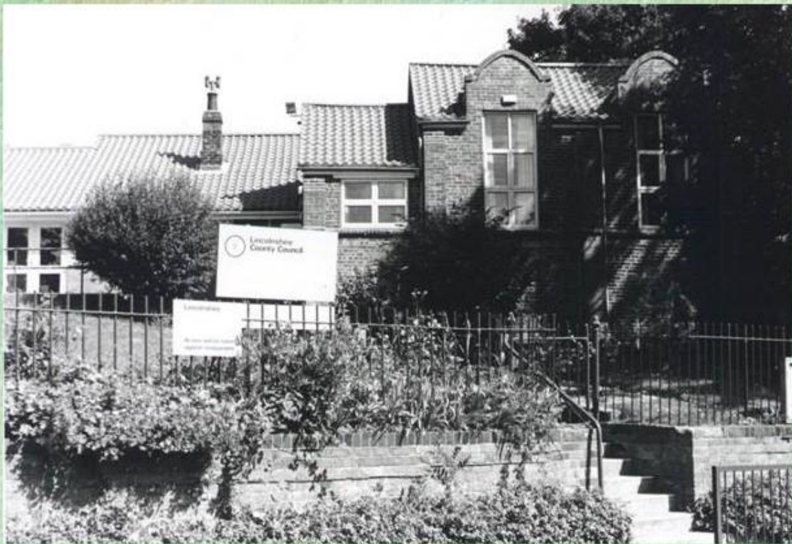
The exterior to the main part of the building has changed very little. The school is opposite the church on Vicarage Lane