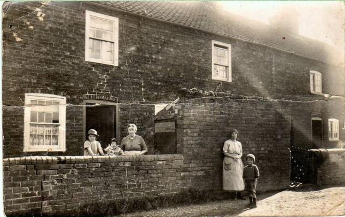
The terrace still exists, fully modernised.