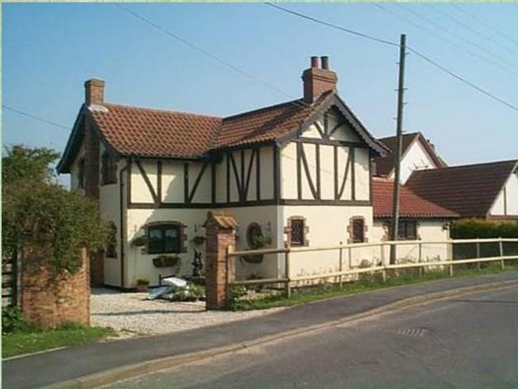
Station Road (the mock Tudor beams have since been removed)