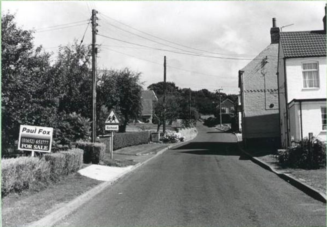
Again, looking north. Temperance Cottage centre left, top photograph (private house today).