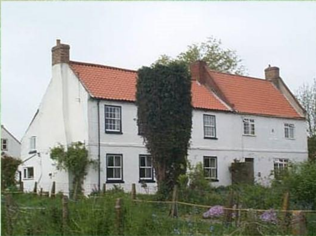
The first dwelling on Station Road and oldest house in village, foundations dating back to 1606.