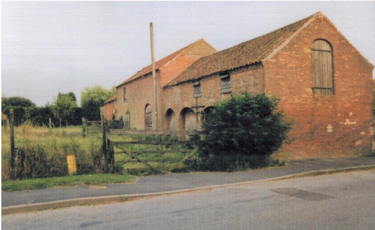
Victorian Barns, Glebe House, Station Road. New house built to left of barn (bottom), but barn retained and renovated by owners of Glebe House (a private dwelling).