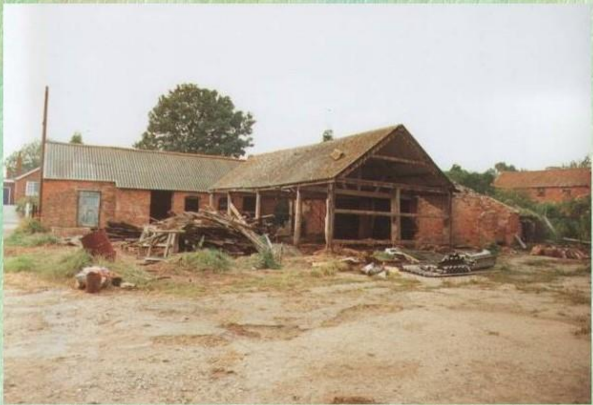
Demolition of Vicarage Farm barns begins. Photographs taken from within stack yard looking towards Station Road.