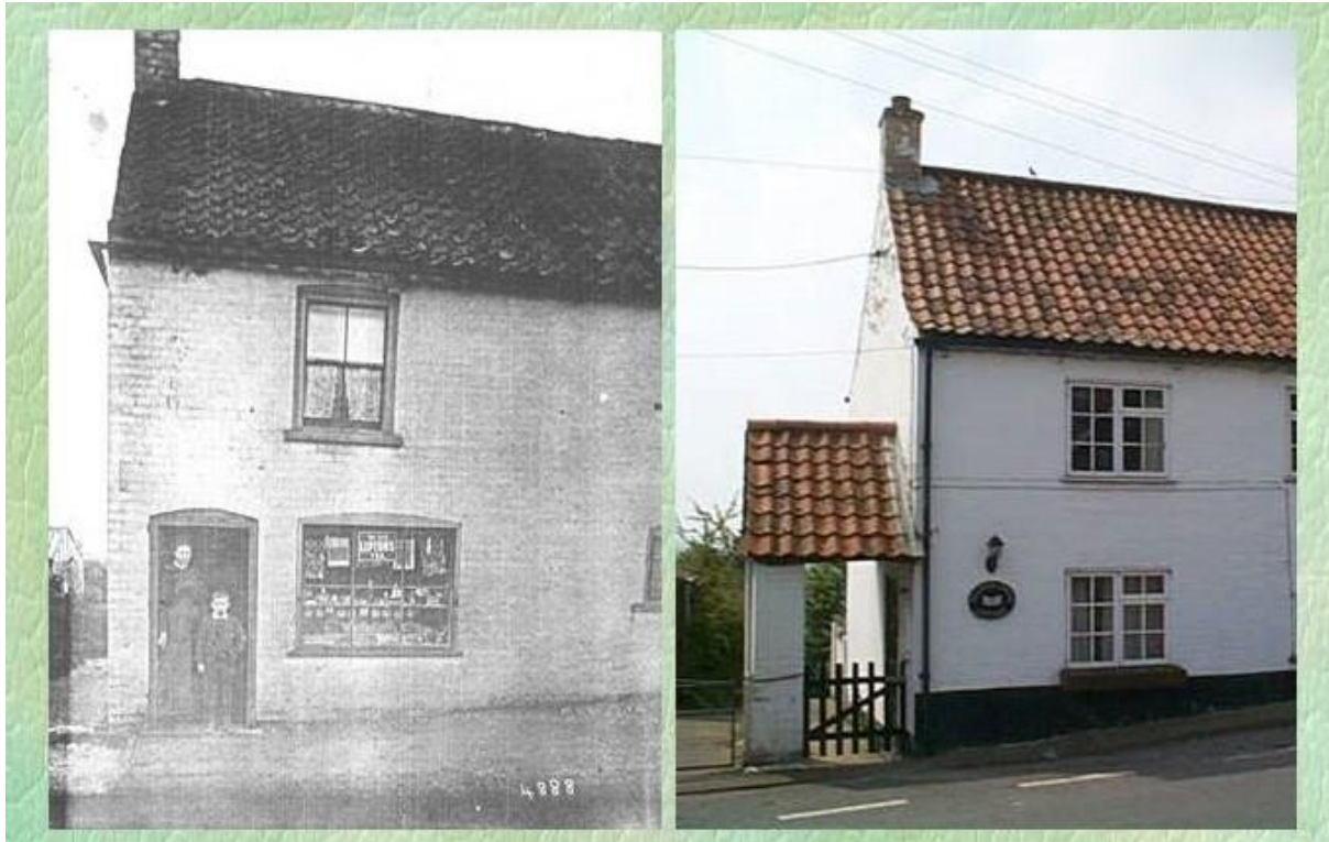
Mrs Lacey and son Fred in front of their shop at Reading Room Cottage. Today it is a modernised cottage opposite to the Post Office at the beginning of Vicarage Lane