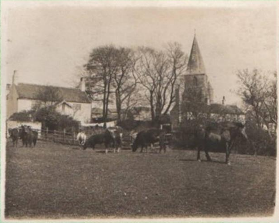
This field is on the north side of Vicarage Lane (now built on) looking SE. Manor Farm is hidden (centre right) from view.