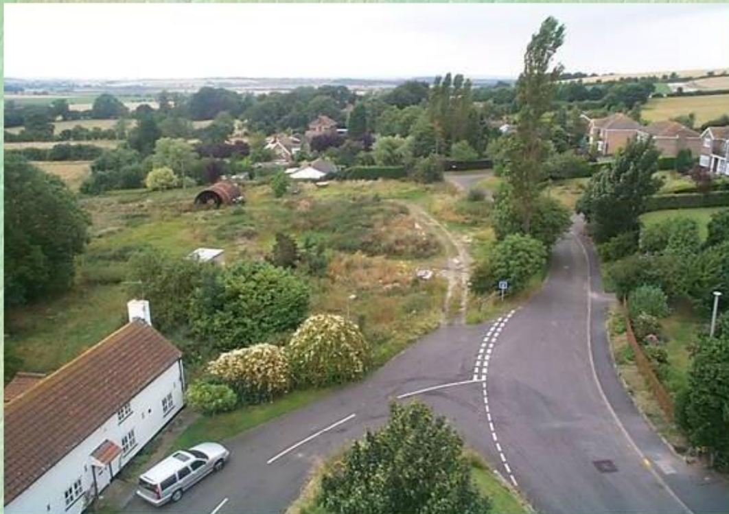
Manor Farm is centre right in the top picture. Since its demolition (bottom) a new dwelling has been built to take its place at Church Close/Vicarage Lane junction. View is west from tower.